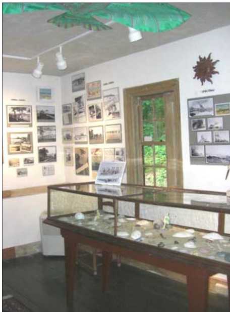
In 2010, about 700 visitors enjoyed the Ogunquit Heritage Museum with all its exhibits. The above room demonstrates how our famous Ogunquit Beach and its dunes had changed over the years.